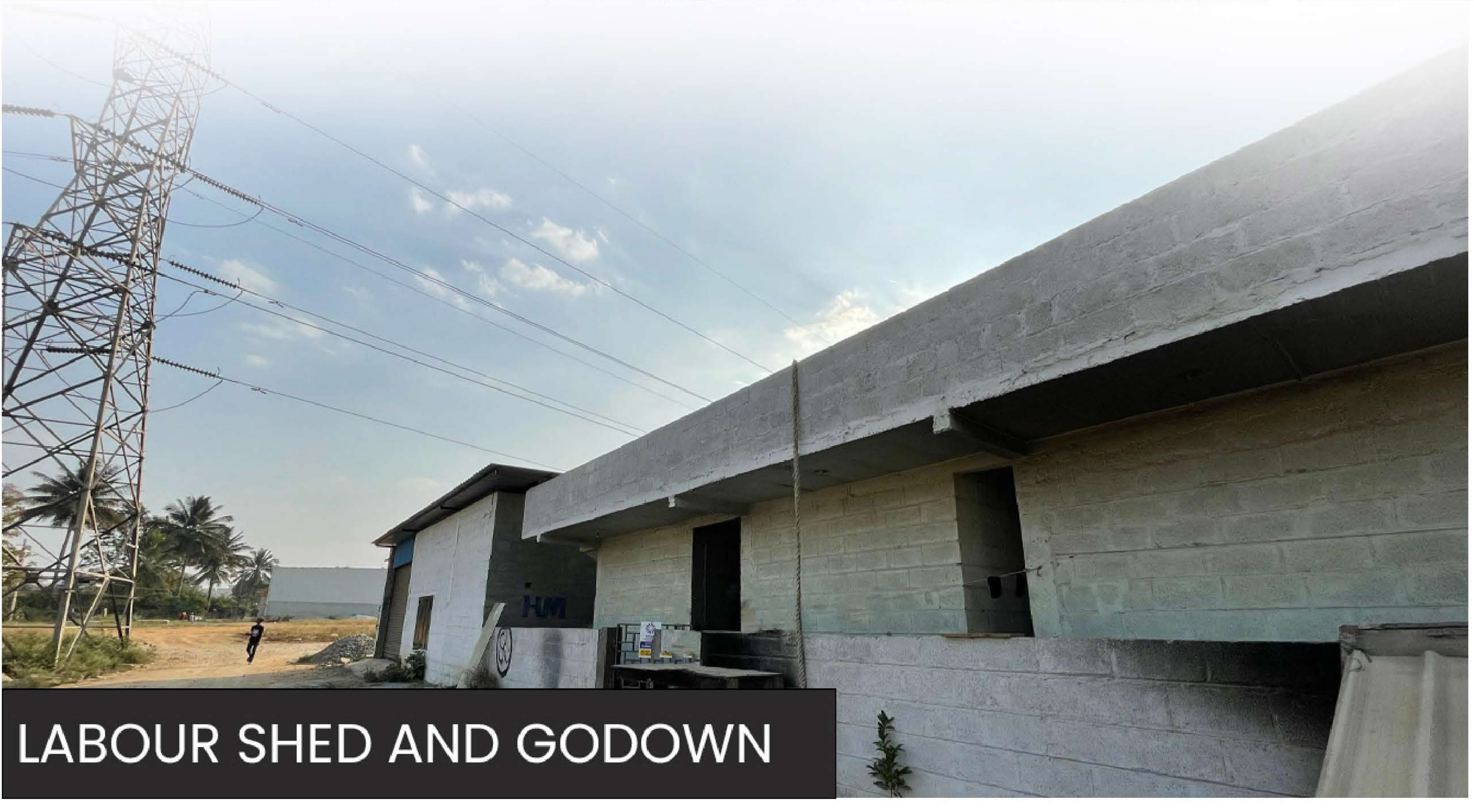
LABOUR SHED AND GODOWN